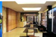
Majestic Roof Garden Hotel

Adelaide is a city of great visual harmony and a classical elegant style, superbly set beside the River Torrens between the Adelaide Hills and waters of Gulf St Vincent. Colonel William Light got it right in 1837 when he laid out his broad streets and surrounded them with a generous green cushion of parkland.