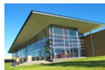
Jacobs Creek Visitor Centre

The result is a place where traffic seldom jams, the inner-city highlights are all an easy walk away and it's virtually impossible to get lost. Within minutes of arriving in Adelaide you'll soon realise that it's not trying to be some other place. It has its own quiet confident air of individuality that gives it instant appeal.