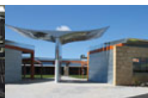
Wolf Blass Visitor Centre