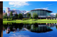
Adelaide Convention Centre