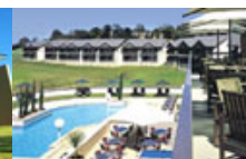
Novotel Barossa Valley Resort